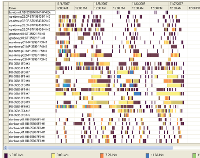
Number of Jobs by Drives

This chart enables administrators to improve backup performance by load-balancing backup jobs across all the available physical tape drives and by scheduling backups more effectively.